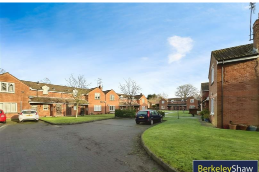
Top Floor Flat, St Georges Court, Maghull

*Measurements of doors, windows, rooms and any other items are approximate and no responsibility is taken for any error, emission, or mis-statement. This plan is for illustrative purposes only and should be used as such by any prospective purchaser. The services, systems and appliances shown have not been tested and no guarantee as to their operability or efficiency can be given. Plan produced using PlanUp.