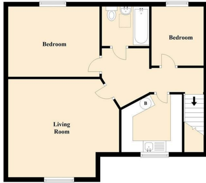
Typical Top Floor Flat

*Measurements of doors, windows, rooms and any other items are approximate and no responsibility is taken for any error, emission, or mis-statement. This plan is for illustrative purposes only and should be used as such by any prospective purchaser. The services, systems and appliances shown have not been tested and no guarantee as to their operability or efficiency can be given. Plan produced using PlanUp.