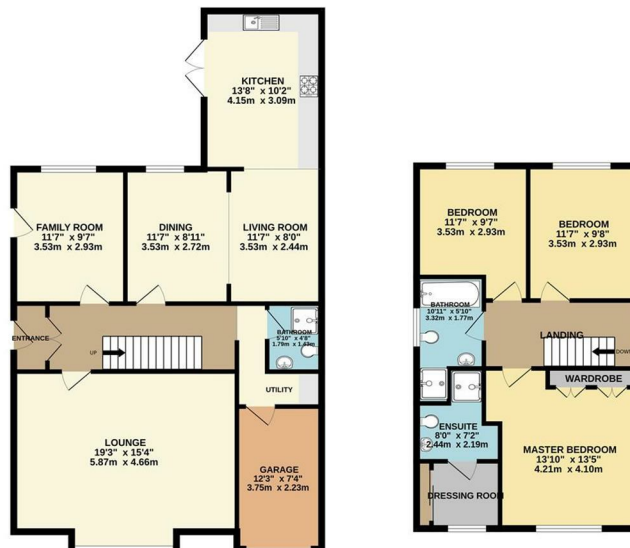
TOTAL FLOOR AREA: 1593 sq ft (148.0 sq m) approx. While every attempt has been made to ensure the accuracy of the floorplan contained here, measurements of doors, windows, stairs and any other items are approximate and no responsibility is taken for any error, omission or mis-statement. This plan is for illustrative purposes only and should be used as a guide for any prospective purchaser. The layout, fixtures and appliances shown have not been tested and no guarantee is given as to their operability or efficiency capabilities. Made with Metropix ©2020.